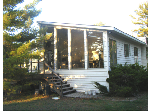
Side view of house. Floor to ceiling glass in the kitchen for a light open feeling that lets nature be part of your experience while in the house.