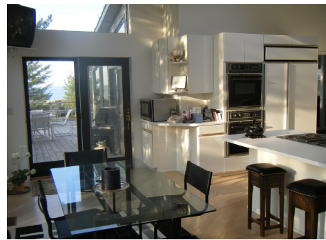
Kitchen has a breakfast area, a bar for light snacks and direct access to the deck & the Lake.