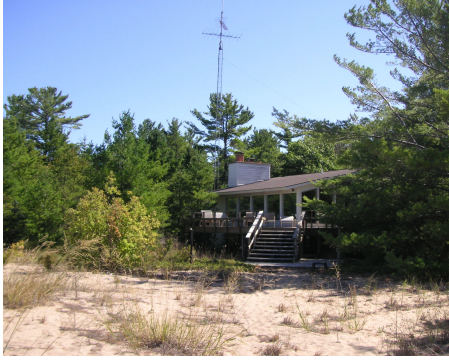
Tucked off the Lake, this 3 bedroom 2.5 bath home will provide you views and seclusion as you desire.