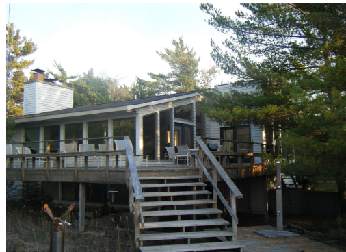
Nice wide stairs provide access to the house or the Lake.