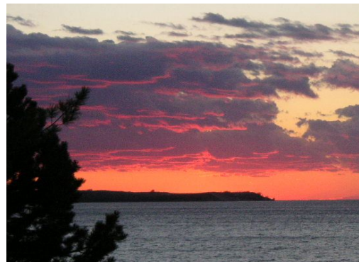
If you enjoy nature painting you a different picture each evening, you will not be disappointed here!