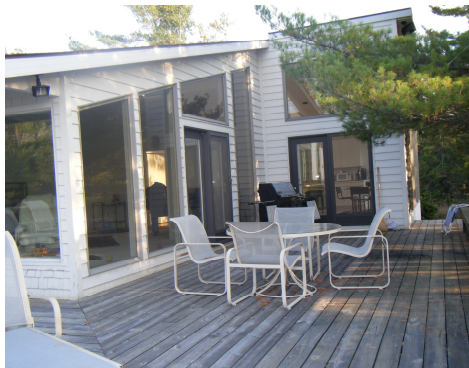
Deck with plenty of space for dining, relaxing or tanning. Deck wraps around the living room of the house.