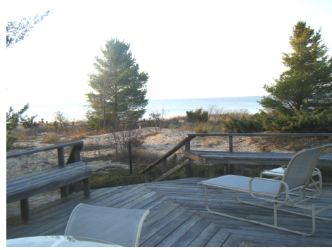
With an oversized deck, you can relax with million dollar views or you can easily walk to the beach for waterfront activities of your choice.