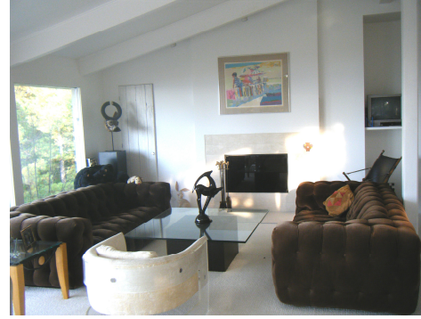
Living room of house. Cathedral ceilings, fireplace and floor to ceiling glass.