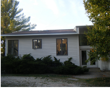
Front of residence. Two bedrooms have a queen bed, one a double and there is a pull out sofa bed.