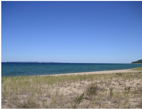
View to the North. The residence is situated between the Village of Glen Arbor and the Homestead Resort.