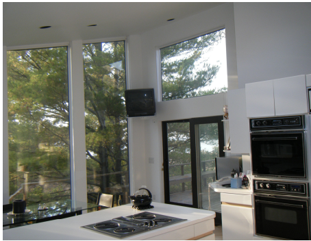
Interior view of Kitchen. Skylight over the large island. It is a grand living space and has what you need to cook or BBQ.