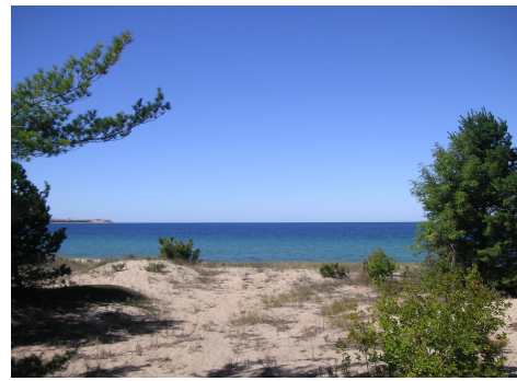
Westerly view from property onto Lake Michigan.....90 miles away is Wisconsin!