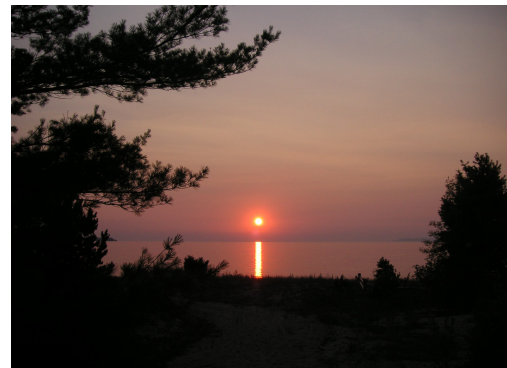
Memorable times await you. We look forward to assisting you with your journey!