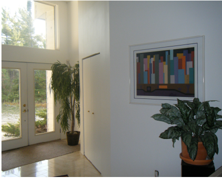
Front foyer and entrance to house. Two story entry with herringbone travertine marble floor.