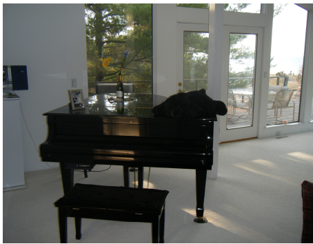
Living room area with views of nature and the Lake. There is plenty of room for games and family activity in this area.